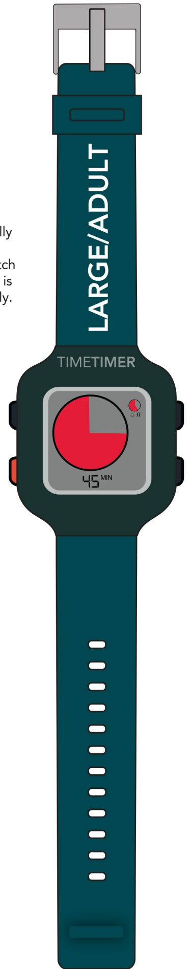
Large fits 5.5" - 8.25" wrist

Size is not actually printed on the Time Timer® Watch bands. Indicator is for reference only.