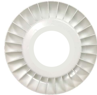
Medication Tray (x2) Item: 991020