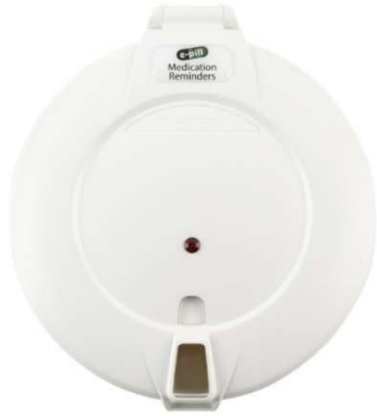
Locked Automatic Pill Dispenser (x1) Item: 991019